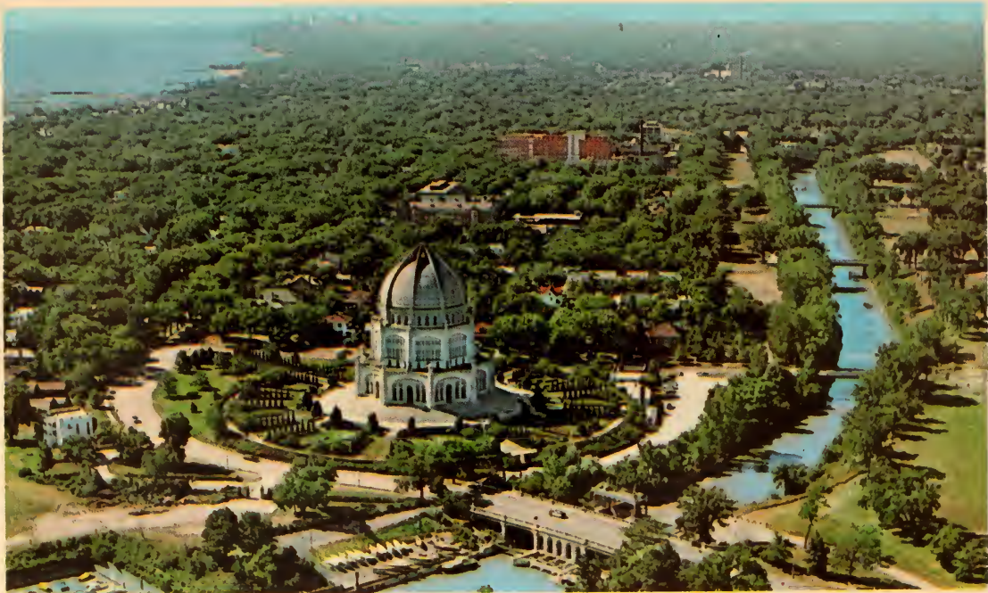
Bahá'í House of Worship